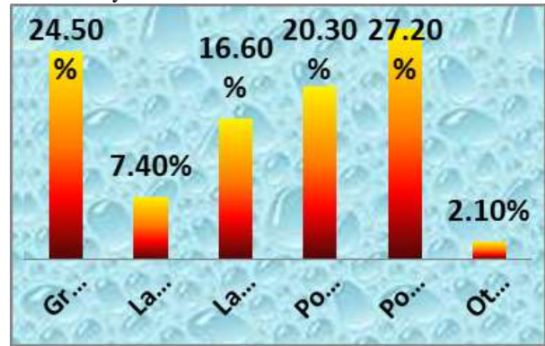
Figure 1: Factors that propel commercial motorcycle riders to indulge in property crime

against 5.4% copies that were not collected back. The number that returned their questionnaire formed the basis for this analysis.